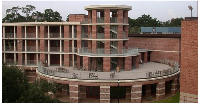
Shared dormitory rooms at Rice University

Meals: While on campus, at least two meals per day, Monday-Sunday will be provided. Students may also have the opportunity to purchase Tetra cards ( Rice U. meal cards ) during the check-in process, to be used on the Rice campus only ( eateries & the “convenience stores only.” )