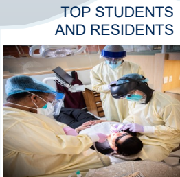
TOP STUDENTS AND RESIDENTS