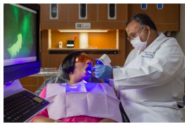
HIGHLY SKILLED FACULTY