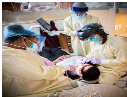
TOP STUDENTS AND RESIDENTS