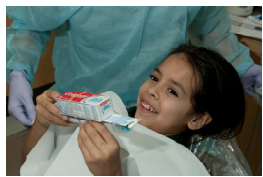
QUALITY PATIENT CARE