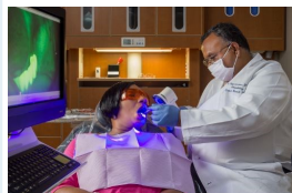
HIGHLY SKILLED FACULTY