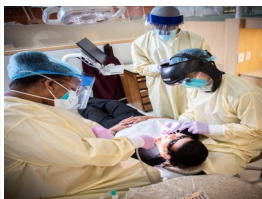
TOP STUDENTS AND RESIDENTS