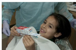
QUALITY PATIENT CARE