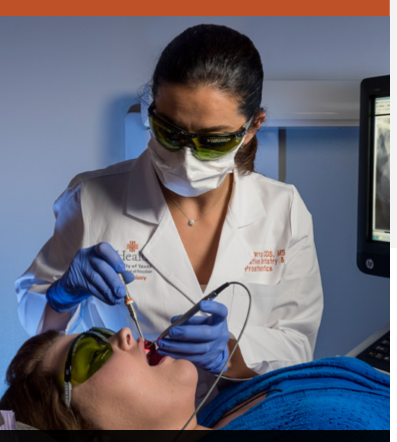
Dental lasers are making a remarkable impact on 21st century dental care by reducing the need for local anesthesia.

Our general dentists, dental specialists and dental hygienists treat patients of all ages with every type of dental problem, and our providers also teach at the School of Dentistry. It's true: We practice what we teach!